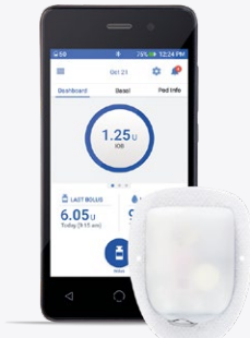
Insulet Omnipod® Dash