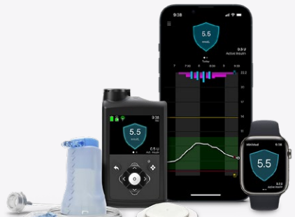
MiniMed™ 780G Pump System