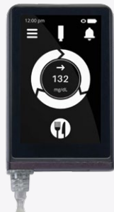
iLet Bionic Pancreas