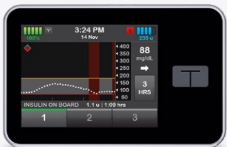
Tandem T-slim X2